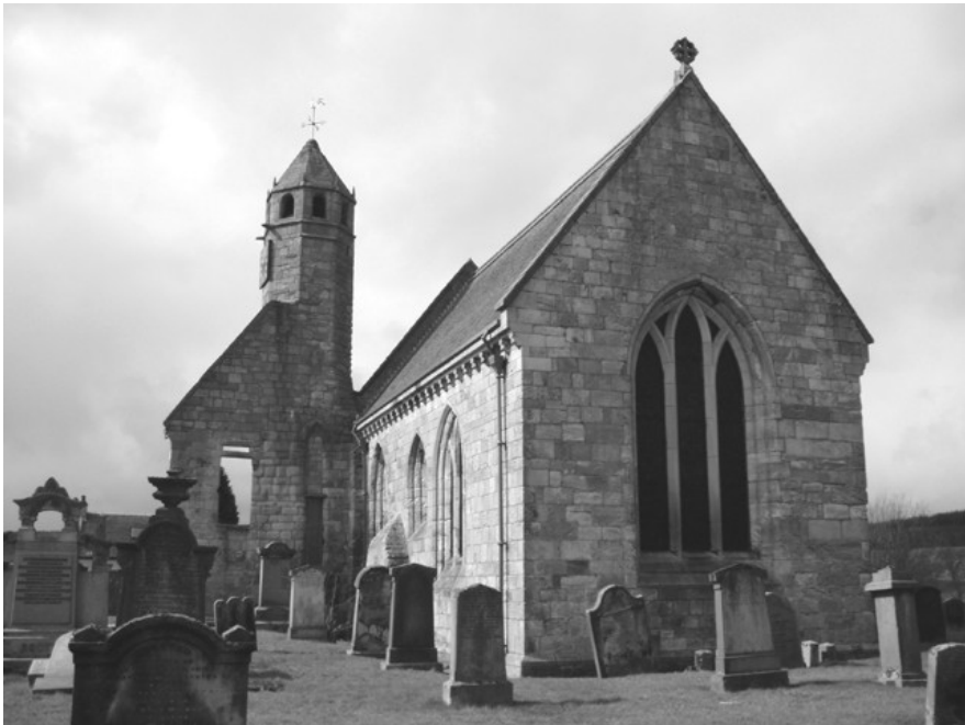
Douglas Kirk, where most of the General Meetings of the United Societies were held in 1689-90.