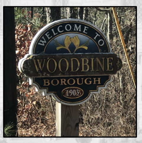
Note: some photos here are from my former parish outreach in S. Providence—plus one that a very proud grandpa just had to sneak in!